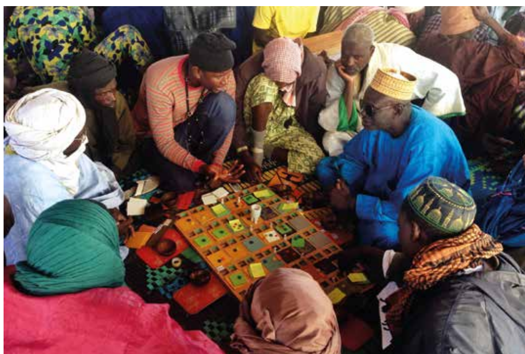
Using participatory modelling of land use in the form of role-playing games helps to promote information sharing and negotiations between actors

Territorial approaches promote inclusive development by supporting growth in all regions instead of just focusing on those places or territories in which economic growth is already taking place.